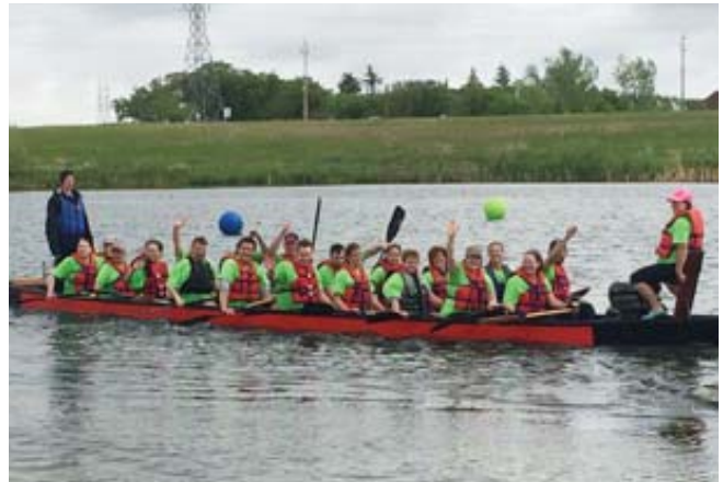
The Conquer-Oars battled the elements as well as their competitors! Friday evening's race was during a beautiful setting of the sun, but Saturday morning's race was a soggy affair. By the afternoon on Saturday, the weather had settled somewhat down.