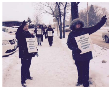
MAHCP members in The Pas wave to motorists honking their support during their information picket on Jan. 27, 2016.