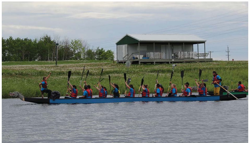
And they were! The Bravo team celebrates after hearing they came in ahead of the competition.