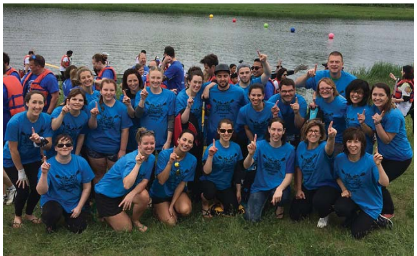
The Conquer-Oars Bravo team that came in first in their heat poses for a photograph following their Saturday morning race on June 4, 2016.