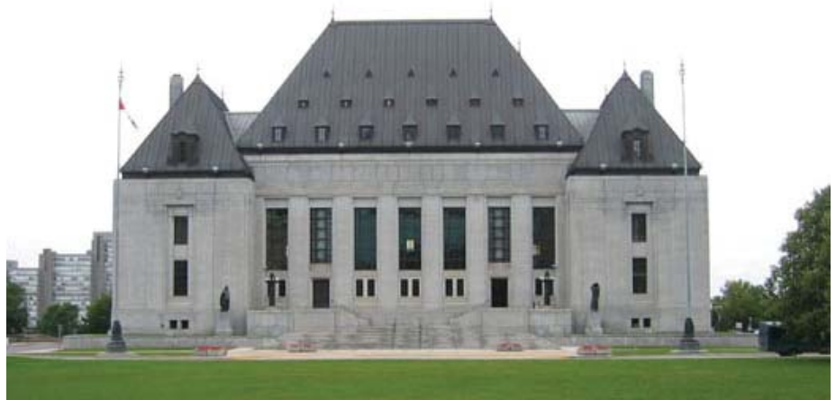
The Supreme Court of Canada.

In an email to MAHCP from HSABC, a representative said the lab in question was a typical hospital lab (biomedical testing). However, there was an issue of an incinerator burning waste and fumes coming through a