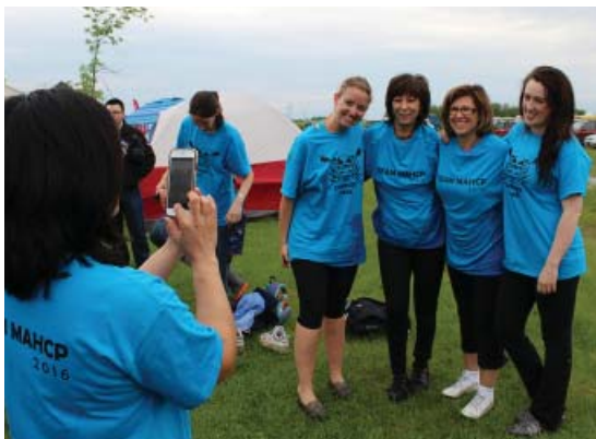
Members of the Conquer-Oars Alpha and Bravo teams were highly visible in their royal blue Viking T-shirts.