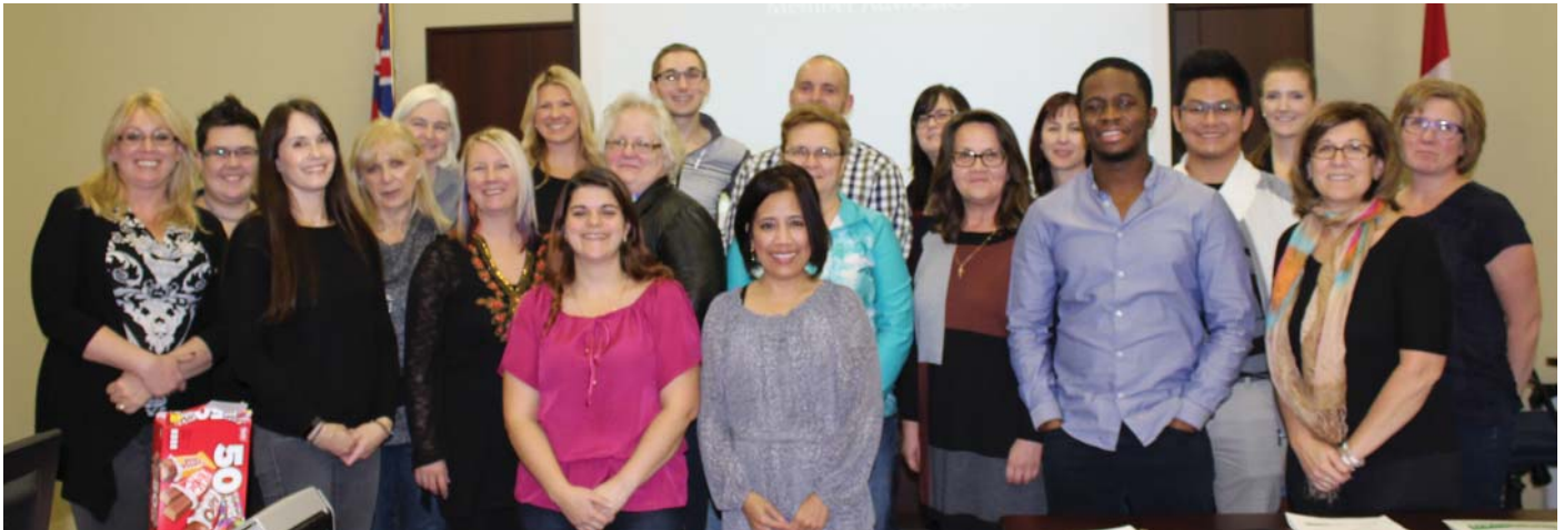
The newly trained Member Advocates class at the end of their session in October of 2016.