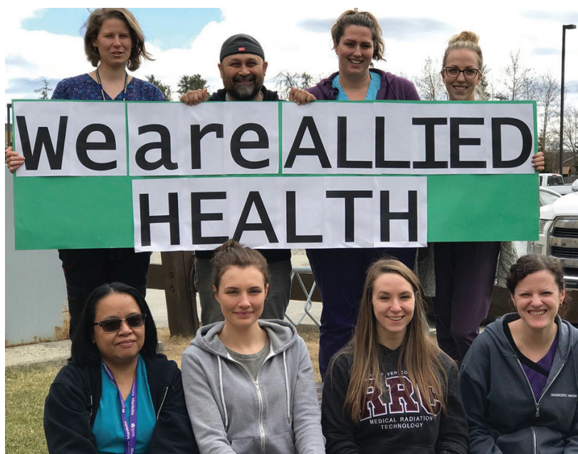
Photo of our MAHCP members in Thompson taken during the 2019 Allied Health Care Week.

All trivia questions and photographs can be sent to communications@mahcp.ca by April 10, 2020 .