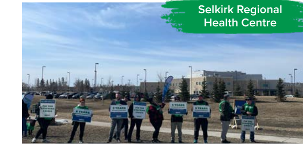
Selkirk Regional Health Centre