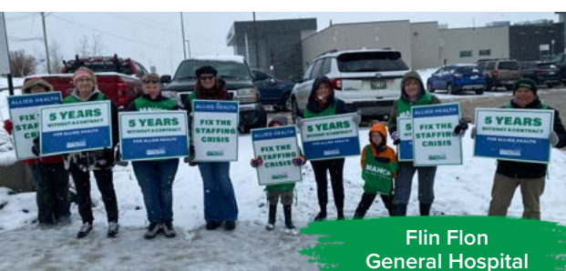
Flin Flon General Hospital