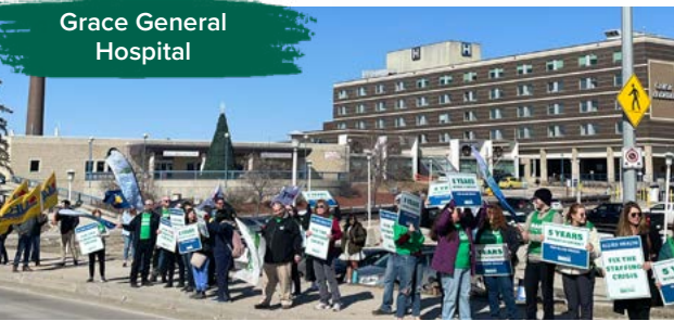
Grace General Hospital