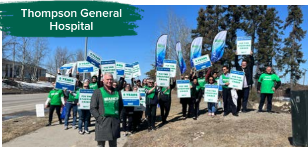
Thompson General Hospital