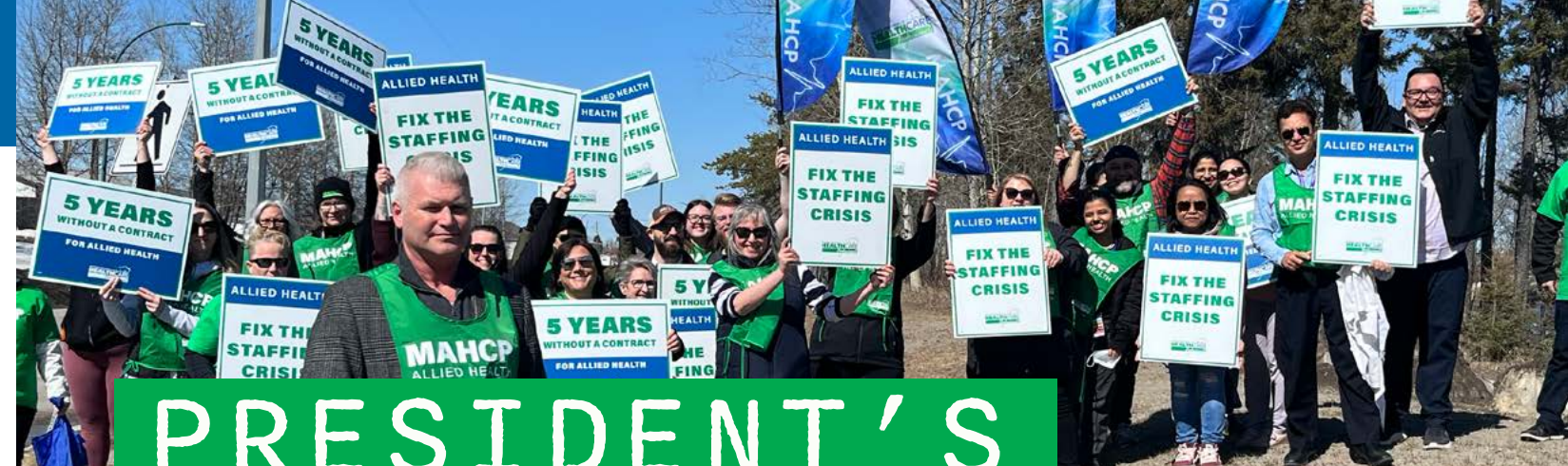
Information Picket at Thompson General Hospital, Tuesday April 25, 2023