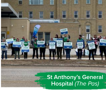
St Anthony's General Hospital (The Pas)