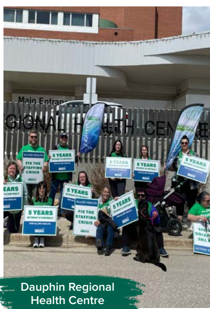
Dauphin Regional Health Centre