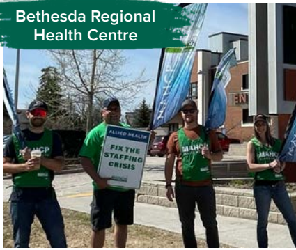
Bethesda Regional Health Centre