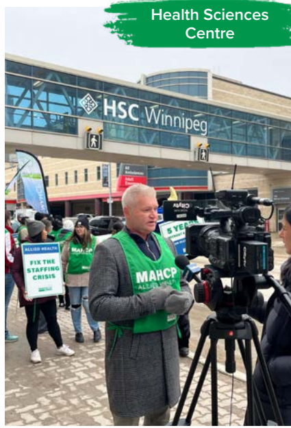
Health Sciences Centre