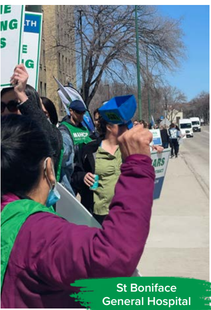
St Boniface General Hospital