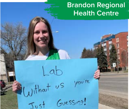
Brandon Regional Health Centre