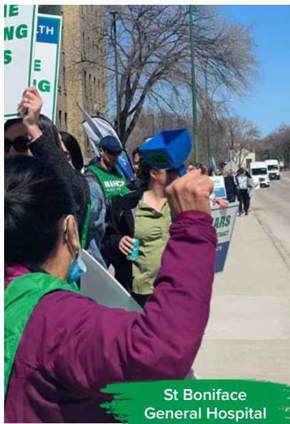
St Boniface General Hospital