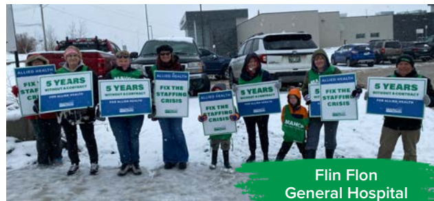
Flin Flon General Hospital