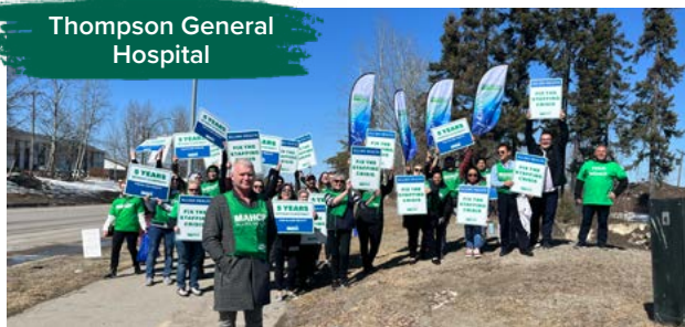
Thompson General Hospital