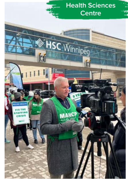
Health Sciences Centre