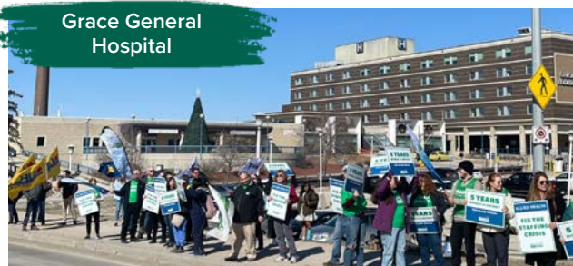
Grace General Hospital