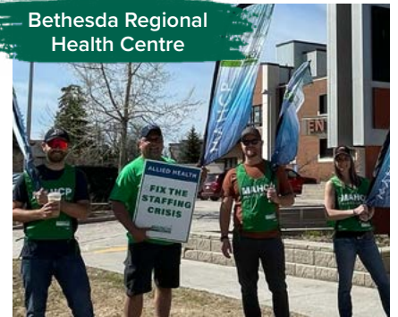
Bethesda Regional Health Centre

Grace General Hospital | April 17 Selkirk Regional Health Centre | April 18 Health Sciences Centre | April 20 Thompson General Hospital | April 25 Flin Flon General Hospital | April 26 St. Anthony's General Hospital | April 27 St. Boniface General Hospital | May 2 Ode'min - Formerly the Birth Centre | May 4 Brandon Regional Health Centre | May 5 Concordia Hospital | May 8 Dauphin Regional Health Centre | May 9 Bethesda Regional Health Centre | May 11 Portage District General Hospital | May 12