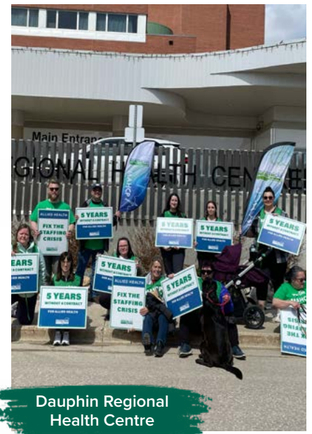
Dauphin Regional Health Centre