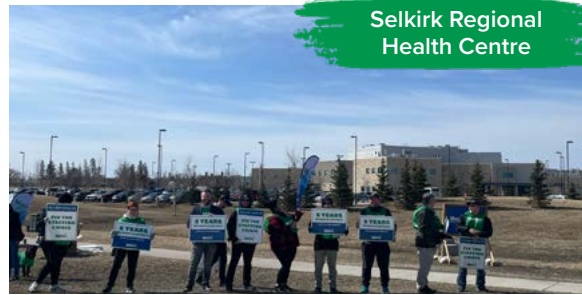
Selkirk Regional Health Centre