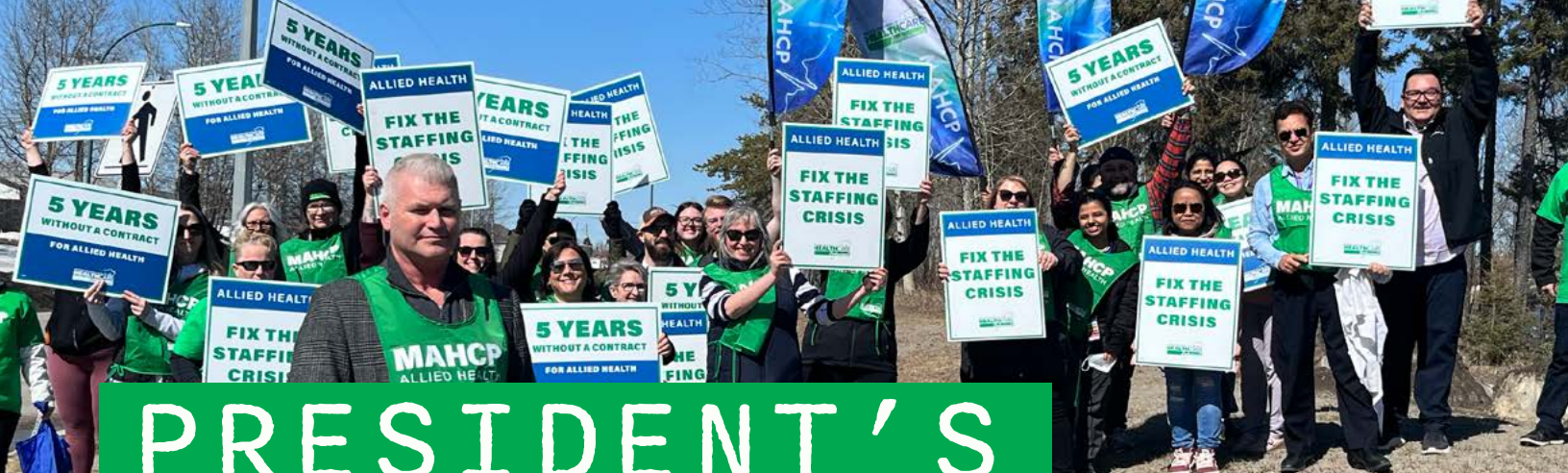
Information Picket at Thompson General Hospital, Tuesday April 25, 2023